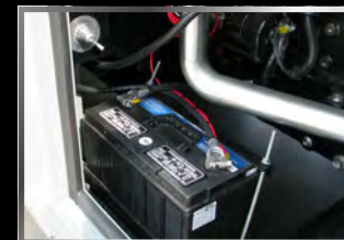
Battery rack, cables and charger