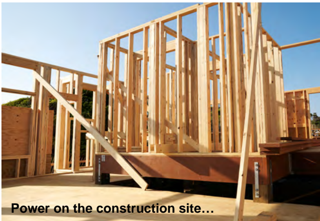
Power on the construction site...

Simple and easy to use features make the Taylor Power Systems Rental Generators the right choice for your needs...put your trust in the most dependable generator on the market Taylor Power Systems.