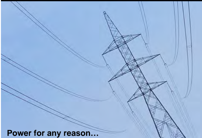
Power for any reason...