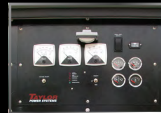
Analog Control Panel