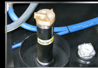
Integral Fuel Tank